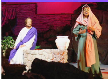
Woman at the Well John 4:5-42- Gospel Reading for 1st Scrutiny

Follow us at Instagram.com/SaintJamesSavannah