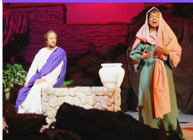
Woman at the Well John 4:5-42- Gospel Reading for 1st Scrutiny

Follow us at Instagram.com/SaintJamesSavannah