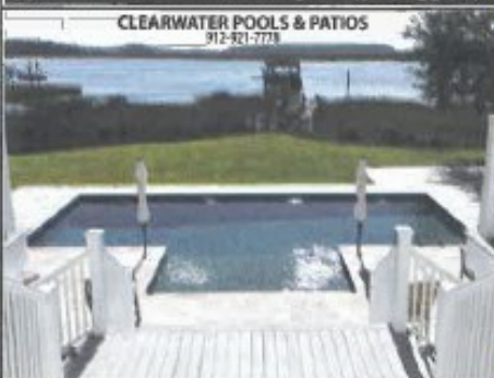
CLEARWATER POOLS & PATIOS 912-921-7778