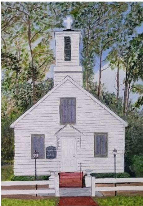
Artist: Sally Welsh