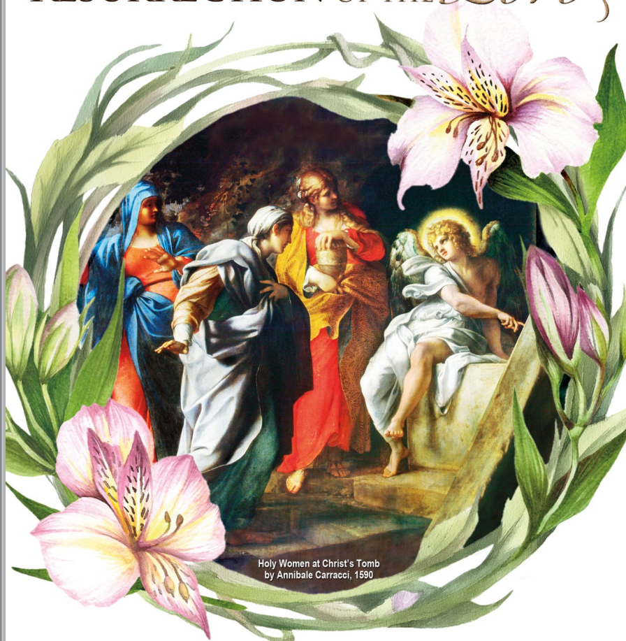
Holy Women at Christ's Tomb by Annibale Carracci, 1590

"Why do you seek the living one among the dead? He is not here, but he has been raised. "