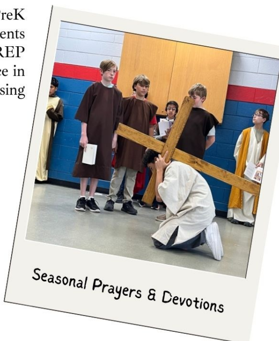
Seasonal Prayers & Devotions

Tuition $65 for one child $100 for two $135 for three + Financial assistance available upon request.