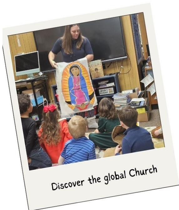
Discover the global Church