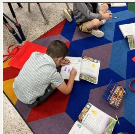
Explore Scripture & Liturgy

"Being Christian is not the result of an ethical choice or a lofty idea, but the encounter with ... a person, which gives life a new horizon and a decisive direction"